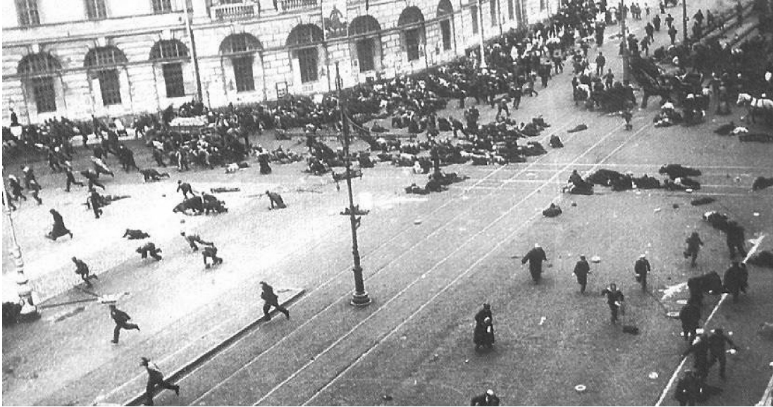
A photograph of troops firing on Bolshevik demonstrators in the streets of Petrograd, July 1917.

11 Look at the photograph, and then answer the questions which follow.