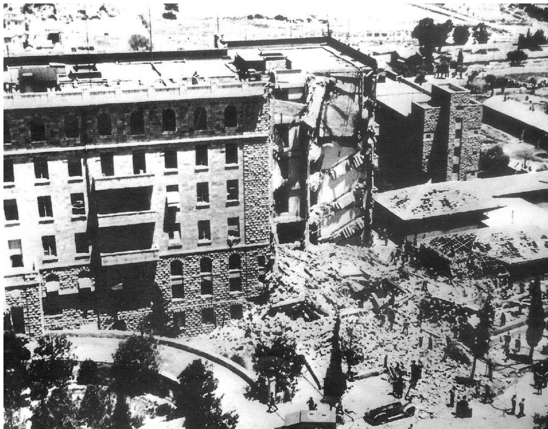
A photograph of the King David Hotel following the attack by Irgun members, July 1946.

20 Look at the photograph, and then answer the questions which follow.