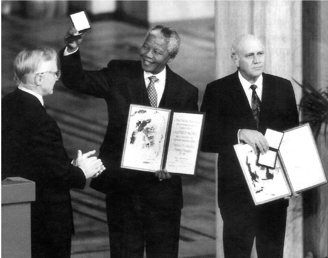
A photograph of Mandela and De Klerk receiving the Nobel Peace Prize in 1993.

18 Look at the photograph, and then answer the questions which follow.