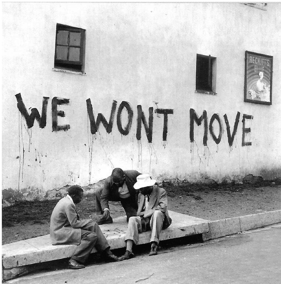
A photograph of the outside of a house in Sophiatown, 1955.

17 Look at the photograph, and then answer the questions which follow.