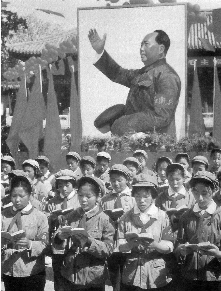
A photograph of Red Guards during the Cultural Revolution.

16 Look at the photograph, and then answer the questions which follow.