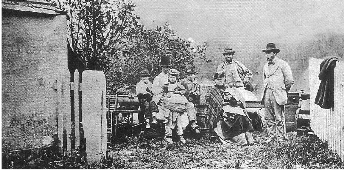
A photograph of a family of farm labourers taken in 1874. They have been evicted from their home. The labourers were members of the National Agricultural Labourers' Union.

23 Look at the photograph, and then answer the questions which follow.